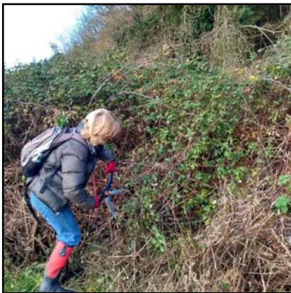
The cutting edge of Walk & Clear

Six volunteer led sessions have been held so far, we have 1 new volunteer and have met with the council twice. All is running smoothly....."