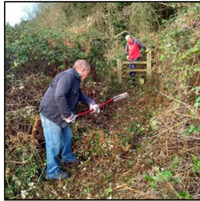
That's the stile!