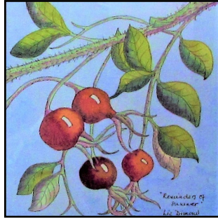
'Reminders of Autumn' by Liz Dimond, exhibited at 'valeways@railways' exhibition

Where has the summer gone? Suddenly Autumn seems to be upon us with conkers and hazelnuts on the paths but still plenty of blackberries to enjoy.